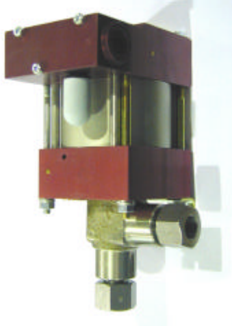
M72(L) single acting, single air drive head (Standard= Bottom inlet)